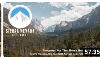
SNA Annual Report '23 Webinar