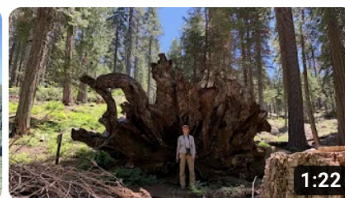
Inside Sierra Nevada Alliance's Forestry Program