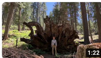
Inside Sierra Nevada Alliance's Forestry Program