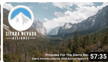
SNA Annual Report '23 Webinar