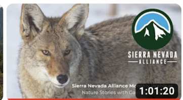
Gavin Furman: Nature Stories