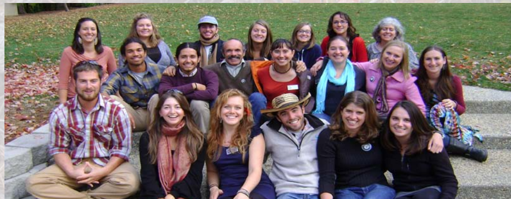
SNAP Members Training 2012.

"No matter how sophisticated you may be, a large granite mountain cannot be denied — it speaks in silence to the very core of your being."