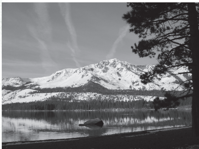
Fallen Leaf Lake

The Alliance also convened meetings of the Sierra Environmental Water Caucus and took the lead in organizing a Sierra Research Assessment