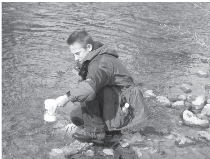
Creek Day watershed monitoring on the Carson River

The Alliance took a leadership role gathering diverse stakeholders to explore how to integrate regional management of water in the Sierra. The Alliance partnered with water agencies, conservationists, and recreationists to propose an integrated regional water management planning