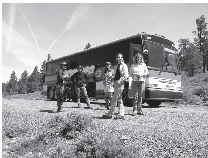
Watershed leaders on tour of restoration projects

The Sierra Watersheds Program has made amazing strides in establishing stewardship groups and building their capacity on Sierra watersheds to assess, protect and restore Sierra lakes, rivers and