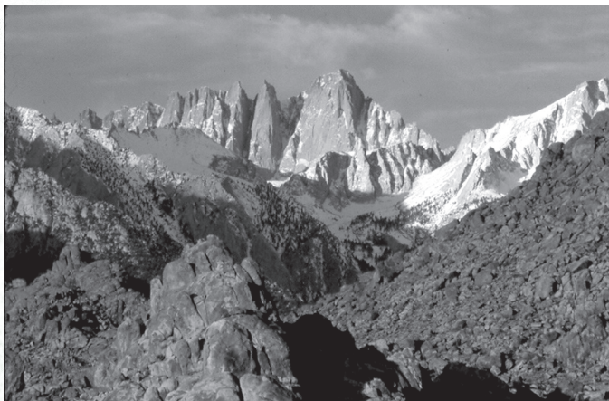
Mt. Whitney

The Alliance received an award in 2005 from The Sierra Fund for our leadership in establishing the Sierra Conservancy. While our region provides 65% of California's developed water, is home to half the plant and wildlife of the state, and covers over a